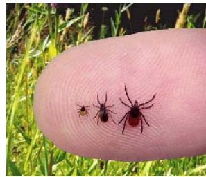
Western black-legged ticks. Pictured from left to right: nymph, adult male, adult female. (Photo courtesy of CDPH).