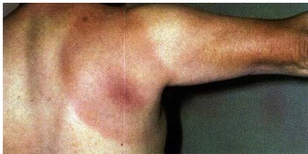
“Bullseye” rash of a patient infected with Lyme disease. Note that this rash does not always occur when someone is infected—it is important to look out for flu-like symptoms and check yourself for ticks.

Consult your healthcare provider if you have been bitten by a tick or were in an area where ticks occur and are concerned about Lyme disease. Painful redness that occurs less than 24 hours after a tick bite and does not expand is likely a local allergic reaction to the tick bite. Early Lyme disease can include flu-like symptoms and often an expanding, painless rash. Lyme disease is treated with antibiotics and most patients recover without complications, particularly when the disease is diagnosed early. If left untreated, Lyme disease can progress to arthritis and in some cases serious nervous system problems.