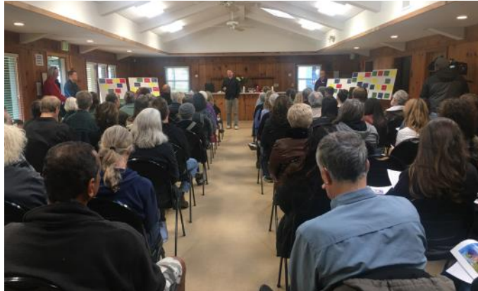
About 100 gathered at Harvey West Park's clubhouse to recognize 58 homeless people who died in 2019.

For a video of the names of the deceased being read aloud, go to https://youtu.be/X8ML4iMz8ZQ .