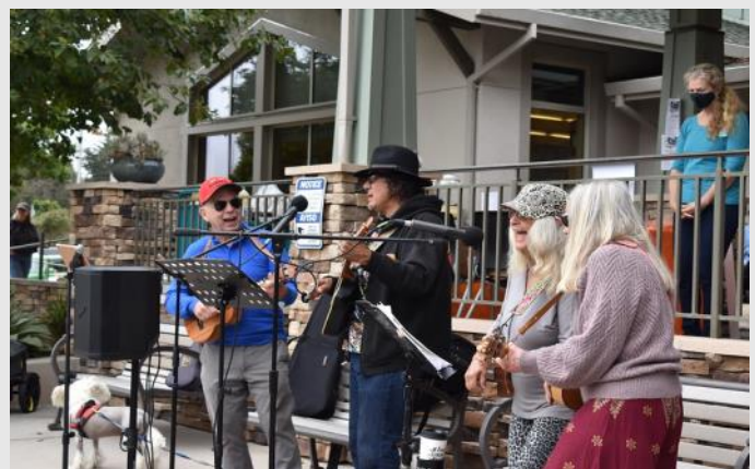
REJUVENATION: The Live Oak Branch Library upgrade is the latest Measure S project to benefit the community, with a celebration held Oct. 1. For a full list of completed and underway projects, go to https://www.santacruzpl.org/measure_s .

The full Point-in-Time Count report will be posted on the Housing for Health Partnership website, at https://