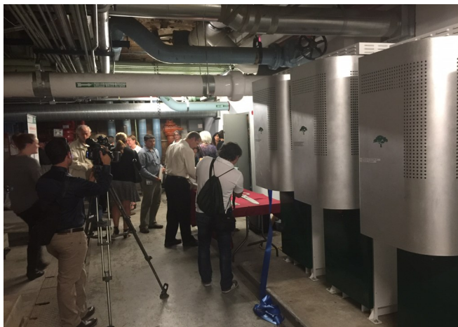
County officials mingled with Green Charge Networks staff during a ribbon-cutting ceremony for new green storage batteries in the County Governmental Center.

In September, officials from Santa Cruz County and Silicon Valley-based Green Charge Networks celebrated the installation of Northern California's biggest intelligent energy storage system. Battery towers at the County Governmental Center protect the environment by storing cheaper energy and releasing it during peak demand.