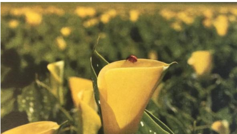
Cut flowers remain one of Santa Cruz County's leading crops, but berries are king.